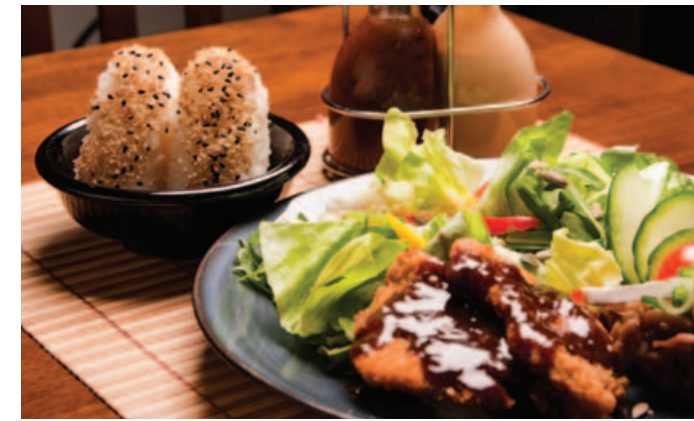
Salad (Pork Katsu & Kimpira)

A bento is a take away lunch box in Japan. Usually a bento contain some rice & various osouzai chosen for a balance of taste and nutrition. Enjoy our bento set menu or create your own from the osouzai menu, side orders and other items. If you order cup of miso soup, it will make a perfectly balanced meal!