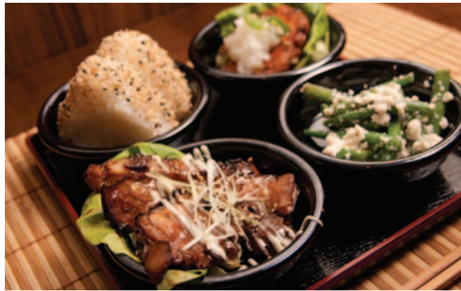
Bento set (Teriyaki Chicken & Gammo)