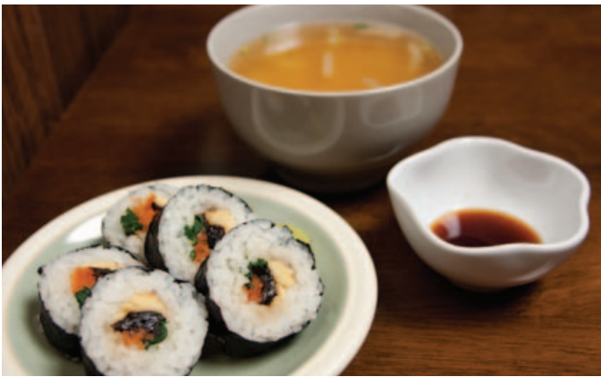
Miso Soup with Sushi Rolls / Set menu