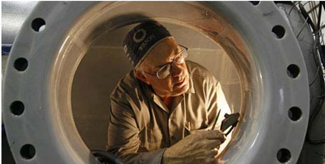
U.S. MANUFACTURERS GETTING DESPERATE FOR SKILLED PEOPLE. "USA TODAY" 12/05/06